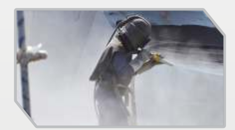
Surface Preparation Sandblasting